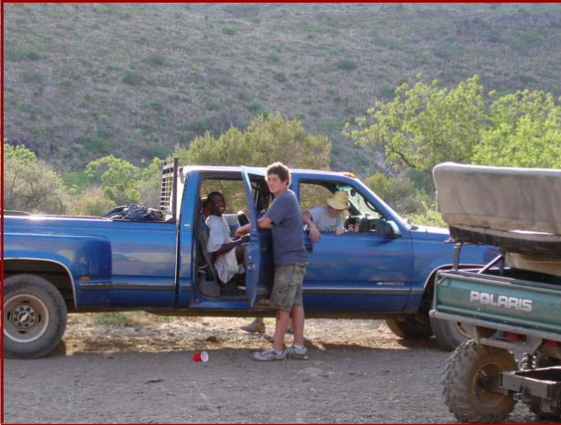
The third "preaching point" of the youth leadership retreat!

The Fourth Annual ALC Youth Leadership Retreat will be held June 6-10, 2007 , at the Heart Ranch. The theme for this retreat is "I Believe!"